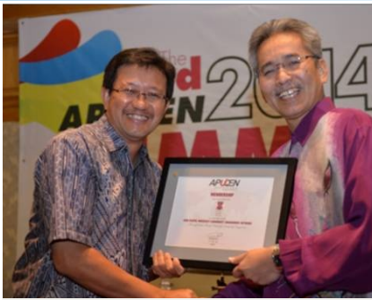
Universiti Malaysia Kelantan, Malaysia