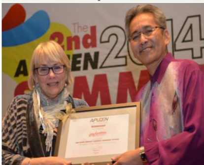
Griffith University, Australia