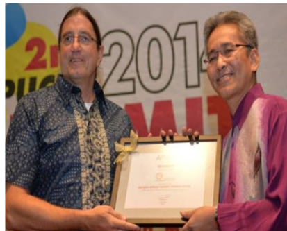
Bonn Science Shop, Germany