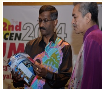
The APUCEN Bulletin was officially launched by Deputy Minister of Education II, YB P. Kamalanathan P. Panchanathan on 22 nd September 2014.