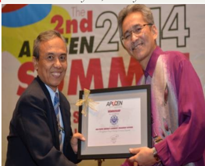
Universitas of Trologi, Indonesia