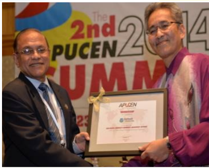
Dafforil International University, Bangladesh