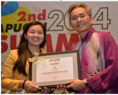
Anteneo de Manila University, Philippines