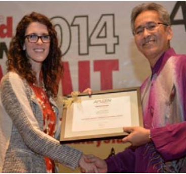
Global Knowledge Initiative, USA