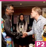
P2 THE 2 ND APUCEN SUMMIT