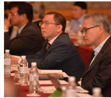
The Summit participants were enlightened with the topics that were near to their hearts.