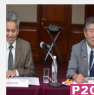
P20 THE 5 TH REGIONAL COUNCIL MEETING