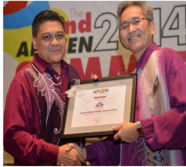
Universitas Malaysia Terengganu, Malaysia