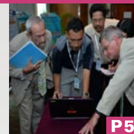
P5 THE ELECTION OF APUCEN COUNCIL (2014-2017)