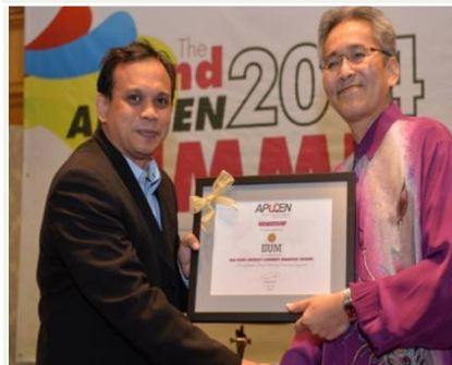
International Islamic University of Malaysia, Malaysia