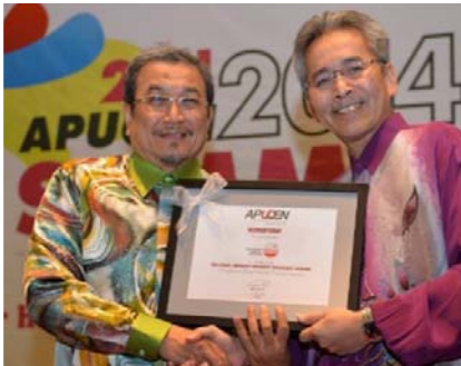
Universiti Tenaga Nasional, Malaysia