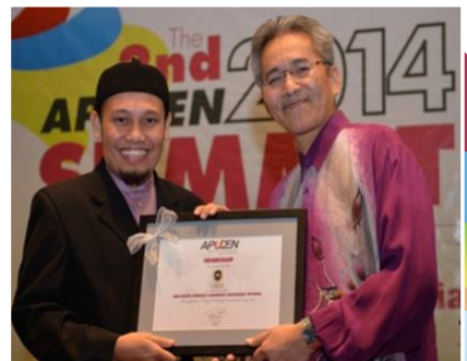
Universiti Sultan Zainal Abidin, Malaysia