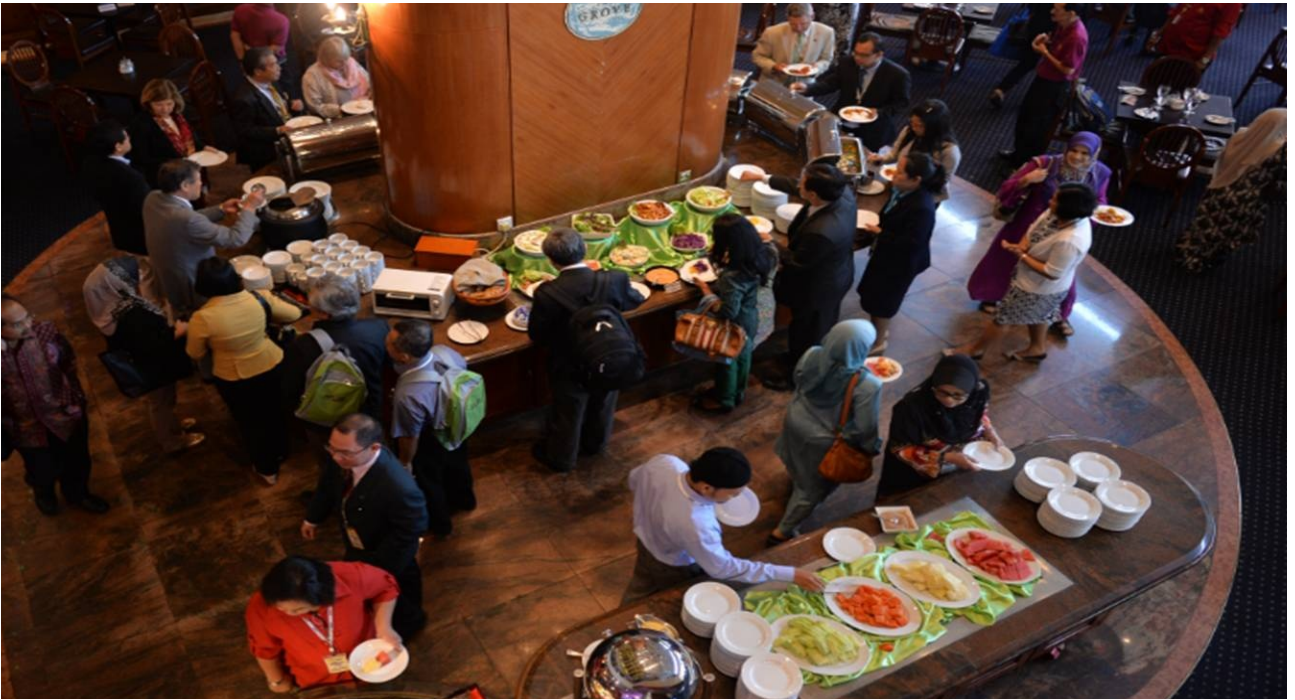
Participants enjoying the Malaysian and International cuisines at the Penang Royal Hotel.