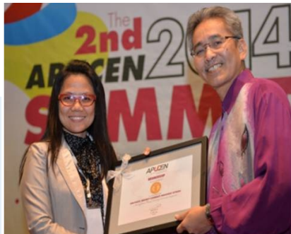
Thammasat University, Thailand