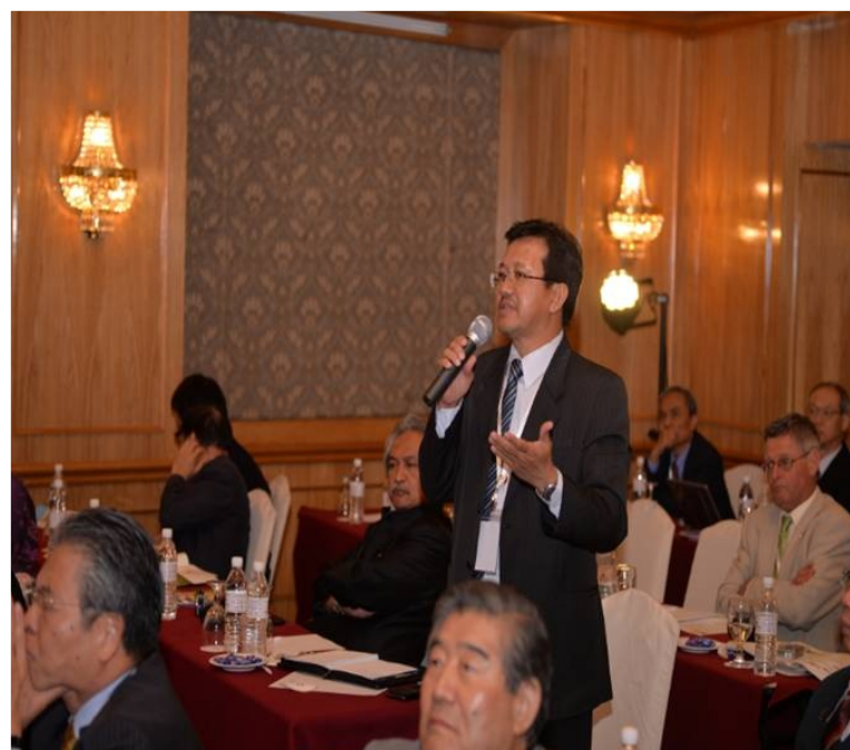
The Question and Answer (Q&A) Session