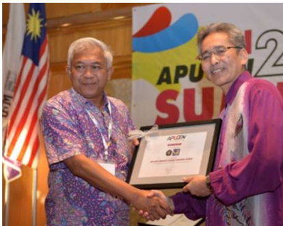
Universitas Brawijaya, Indonesia