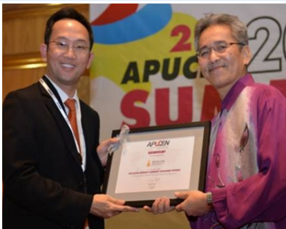
Mah Fae Luang University, Thailand