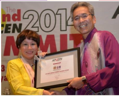
Universitas Sains Malaysia, Malaysia