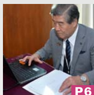
P6 APUCEN COUNCIL MEMBERS (2014-2017)