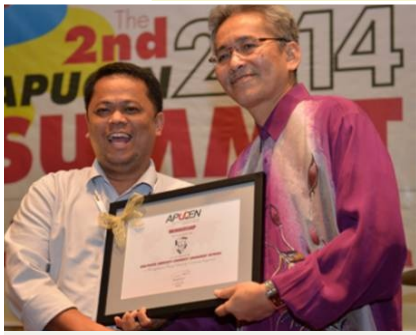
San Pedro College, Philippines