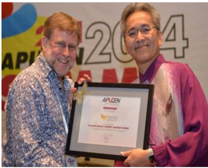
University of Southern Queensland, Australia