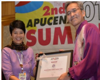
Chiang Mai University, Thailand