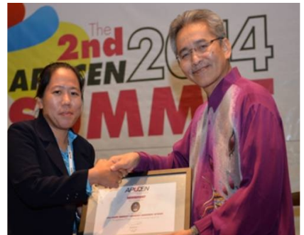
Suratthani Rajabhat University, Thailand