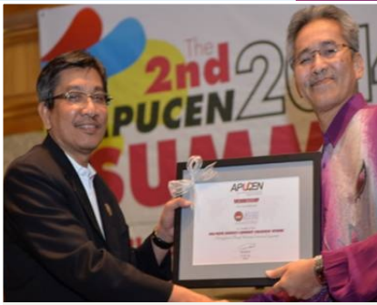
Universiti Perguruan Sultan Idris, Malaysia