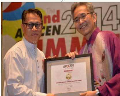
Kolej Universiti Perguruan Ugama Seri Begawan, Brunei