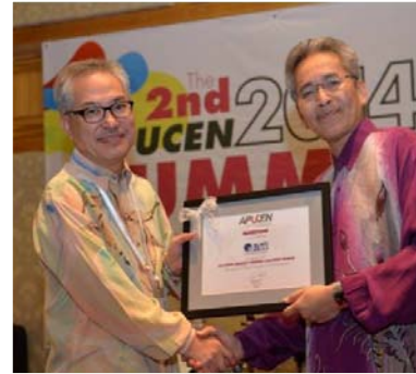
Universiti Teknikal Malaysia, Malaysia