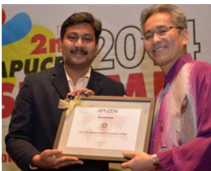
Kadambari Memorial College, Nepal