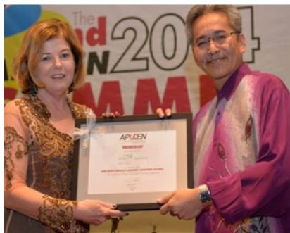
Australian College of Applied Psychology, Australia