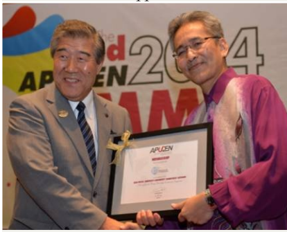
Kyoto University of Foreign Studies, Japan