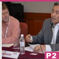
P2 THE APUCEN GENERAL ASSEMBLY MEETING