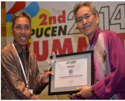
Universitas Negeri Surabaya, Indonesia