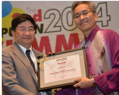
J.F Oberlin University