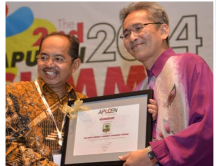
Universitas Andalas, Indonesia