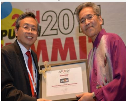
Universiti Tuanku Abdul Rahman, Malaysia