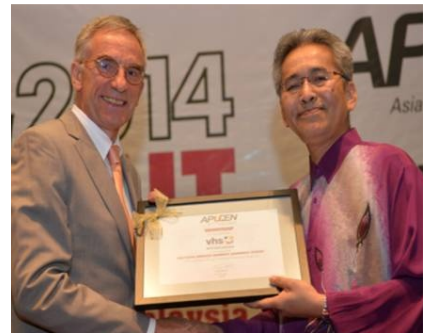
DVV International, Laos PDR