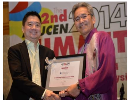
Mahidol University, Thailand