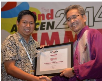
Universiti Putra Malaysia, Malaysia