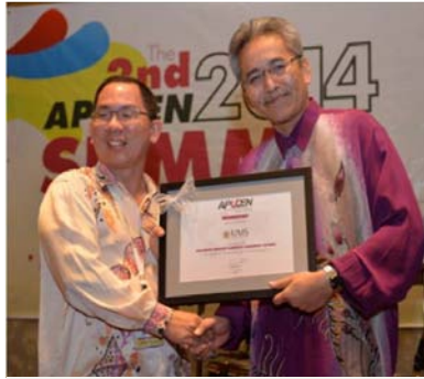
Universiti Malaysia Sabah, Malaysia