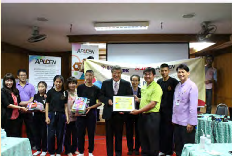
Wat Weruwan School

The objectives of the project are to expose the children to English education and to instill the interest of applying and adopting English as the second language. APUCEN in collaboration with DICN and Chiang Mai University (CMU) had given the opportunity to help the children from various schools under Saraphi Health Model Project. Learning a second language is exciting and beneficial at all ages. Through this English book donation by APUCEN, USM and CMU, we hope that it can help to improve the English language proficiency among the youngsters and students by improving their reading skills, widening their knowledge and developing a global mindset. The four schools that benefited from this project were Wat Tha Ton Kwao School, Wat Weruwan School, Sarapeepittayakom School dan Sridonchai Municipality School, all of which are special schools that focus on moral development in Saraphi district.