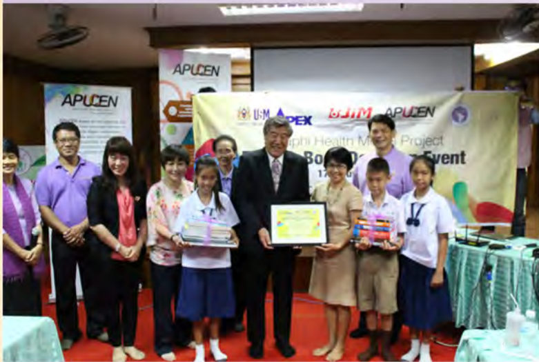
Sridonchai Municipality School