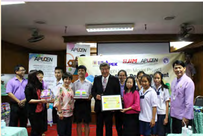
Wat Tha Ton Kwao School