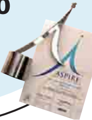
Association for Medical Education in Europe (AMEE) ASPIRE for Excellence Award in the area of "Student Engagement".