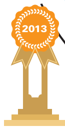
MacJannet Prize for Global Citizenship